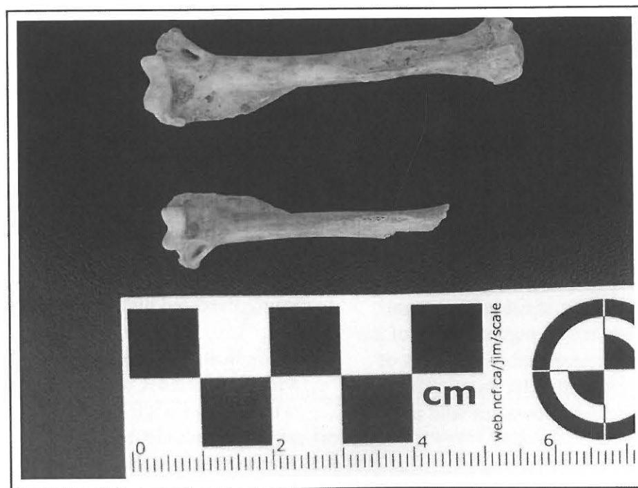
Figure 3. Top: Left humerus of fox squirrel ( Sciurus niger ). Bottom: Partial right humerus of probable gray squirrel ( Sciurus carolinensis ).